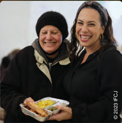
710,640 Hot Meals were served to needy people in 24 soup kitchens across Israel