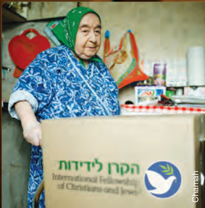
6,858 Elderly in the FSU received essential survival items: food, blankets, clothing, wood, and heaters