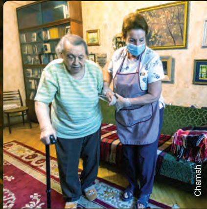
472,659 hours of Home Care to assist frail elderly with basic activities of daily living, such as bathing, laundry, and cleaning avg. 7 hours/ week per person