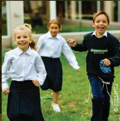
600 backpacks Filled With School Supplies were provided for children