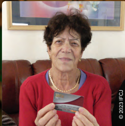
3,242 Israelis were provided with heating cards to keep warm in the frigid cold