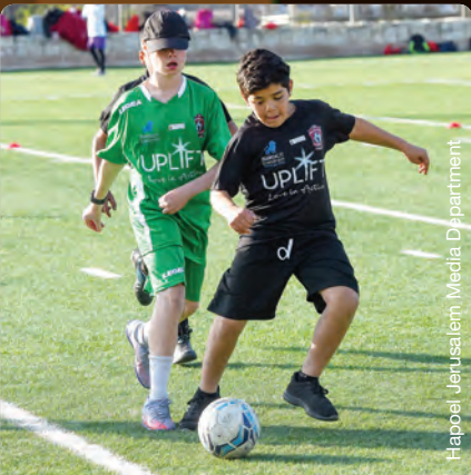
1,125 children were given scholarships to summer camps, enrollment in soccer programs, and hands-on vocational training for youth.