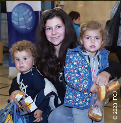
8,077 children who were displaced or living in homeless shelters were given clothing cards for the school year