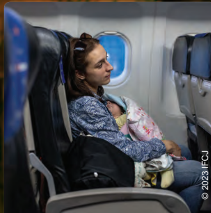
1,529 Jewish Refugees were given rescue on Fellowship Freedom Flights and a stipend to build their new lives in the Holy Land